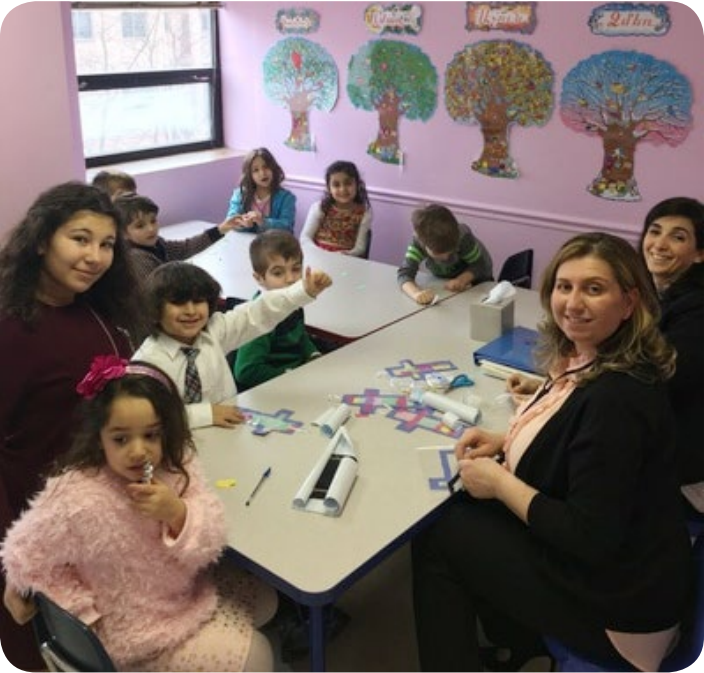
Sunday School Teacher's Seminar