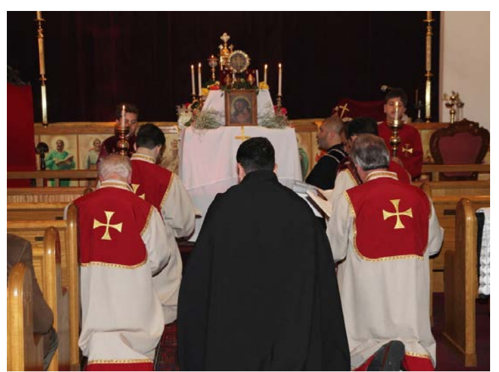
Քրիստոս Ցարեաւ Ի Մեռելոց Krisdos Haryav ee Merelotz Christ has Risen from the Dead

Good Friday services were observed in front of the symbolic tomb of Jesus, which was decorated with flowers donated by our parishioners.